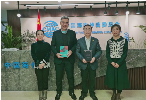
Receiving Visits From Foreign Delegations

CMAC delegations made marketing trips to Russia, Hong Kong SAR, Macao SAR, Malaysia and Singapore, and received visits from Malaysia, Brazil and Russia. By signing MOUs with different counterparts, we have deepened collaborations and generated greater awareness of CMAC in the Asia-Pacific region.